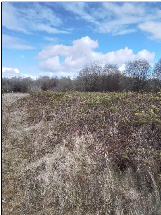
Plate 3. Scrub (WS1) habitat in the south of the study area

This habitat is considered to be of Local importance (higher value) , due to the relatively high species diversity present here and its broad habitat potential.