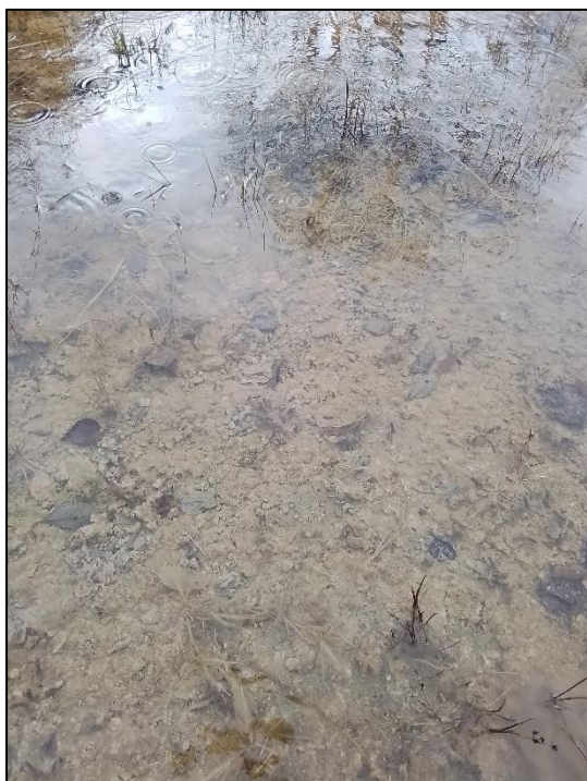
Plate 8. Calcareous springs (FP1) habitat within the south of the study area, showing the abundant deposited tufa and some inundated bryophytes, including scattered plants of Bryum pseudotriquetrum