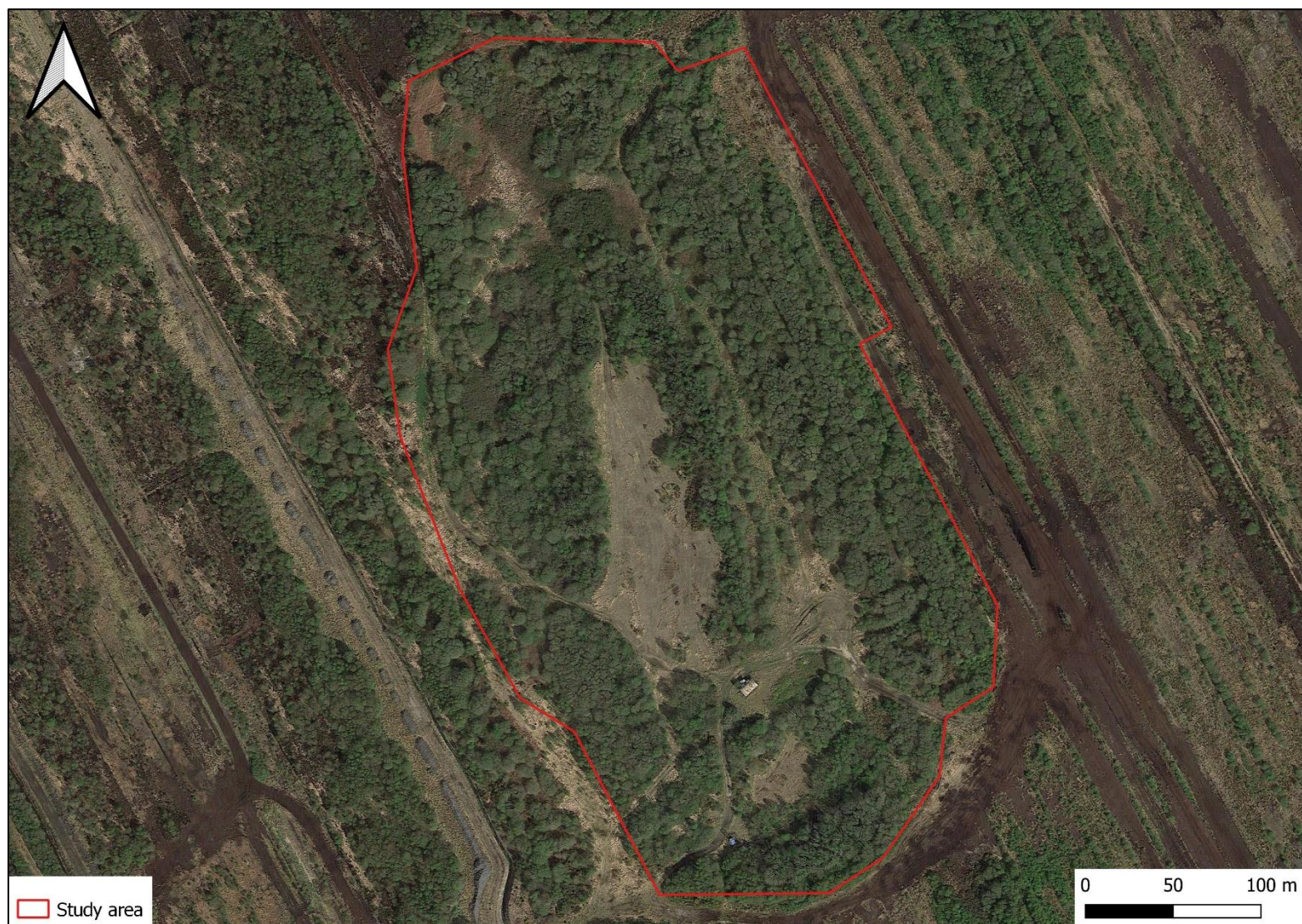
Figure 1. Derryadd study area (in red) – background mapping is © Google Satellite