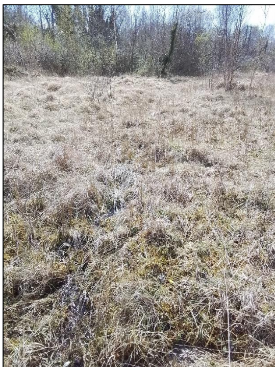
Plate 6. Rich fen and flush (PF1) vegetation within the south of the study area