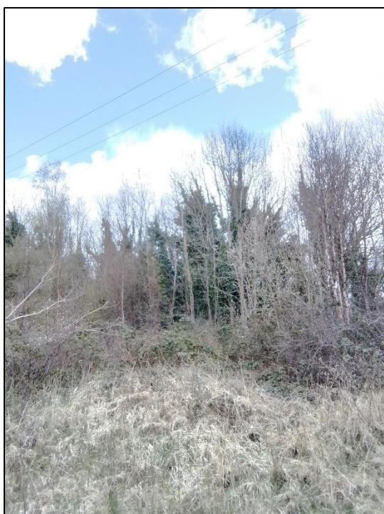
Plate 5. Immature woodland (WS2) vegetation within the south of the study area

Immature woodland (WS2) (see Plate 5) habitat occurs widely across the study area, and is the most dominant habitat on the study area, along with scrub (WS1). This immature woodland appears to have formed by natural means from scrub habitat in this under-managed area and is currently dominated by the canopy species Betula pubescens and Salix cinerea subsp. oleifolia . Rubus fruticosus agg., Hedera helix , Ulex europaeus and Arrhenatherum elatius occur within the undergrowth. This habitat is considered to be of Local importance (higher value) , due to its broad habitat potential to form mature woodland over time, despite its current immature status.