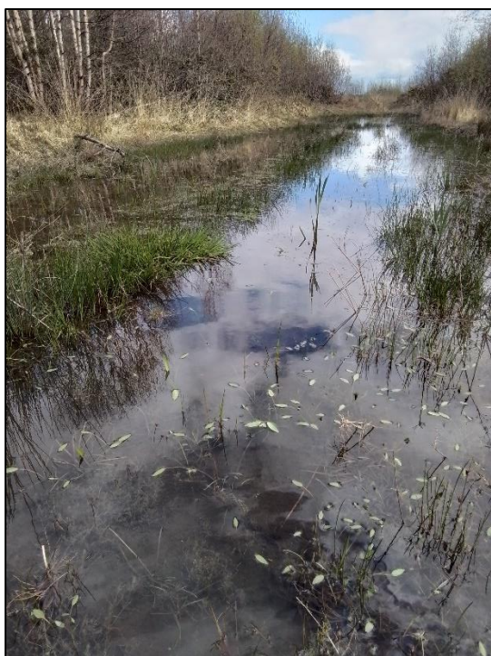
Plate 1. Other artificial lakes and ponds (FL8) habitat in the south-east of the study area

This habitat is considered to be of Local importance (higher value) , due to the relatively high species diversity present here and its habitat potential (petrifying spring (FP1) habitat may form here over time – see below).