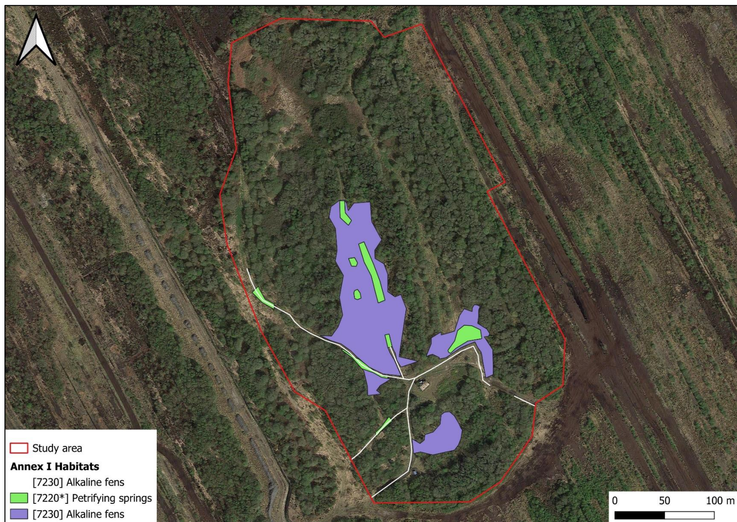
Figure 3. All EU Habitats Directive Annex I habitats recorded within the study area during the field survey in 2023 – background mapping is © Google Satellite