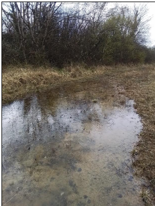
Plate 7. Calcareous springs (FP1) habitat within the south of the study area

This habitat is considered to be of National importance , given the scarcity of such wetland features on a national scale and their current “ inadequate ” conservation status in Ireland (NPWS, 2019).