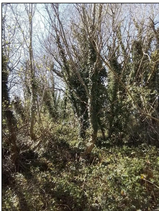
Plate 4. Oak-ash-hazel woodland (WN2) vegetation within the south of the study area

Some areas of WN2 habitat correspond with the EU Habitats Directive Annex I habitat [91A0] Old sessile oak woods with Ilex and Blechnum in the British Isles. However, the area of WN2 habitat within the study area is not classified as such due to the lack of sufficient key indicator species for this habitat type, including Quercus species. This habitat is considered to be of County importance , due to its relatively well-developed woodland vegetation, which is locally scarce.