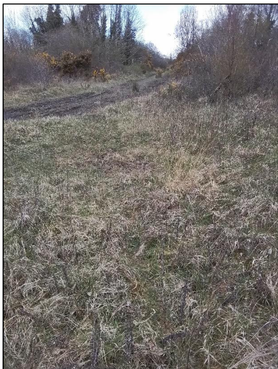
Plate 2. Dry calcareous and neutral grassland (GS1) habitat in the south of the study area

This habitat is considered to be of Local importance (higher value) , due to the relatively high species diversity present here.